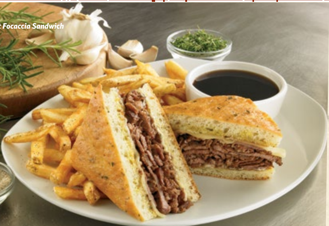
Filet Focaccia Sandwich

Topped with lettuce, tomato, onion, pickle and mustard. Add cheese at no charge 11.49