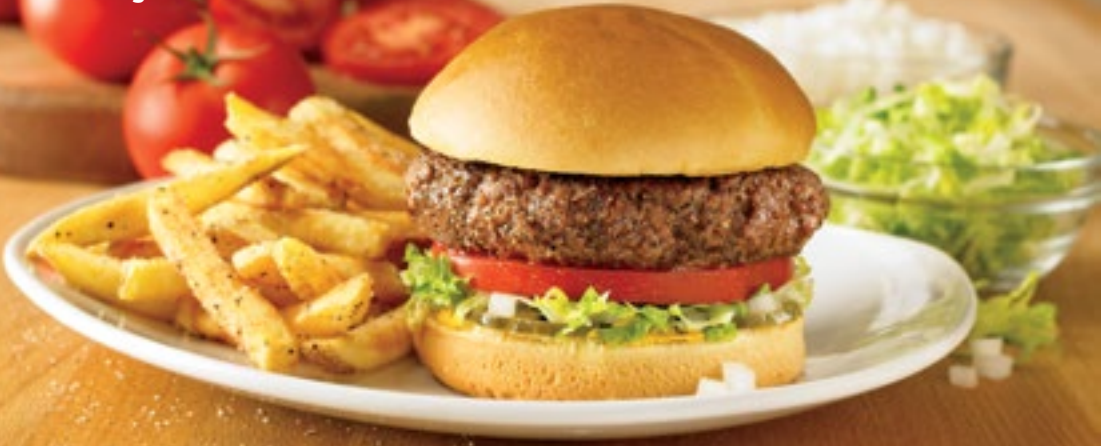
The Outbacker Burger